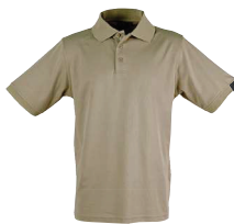
BEIGE (PS33 ONLY)