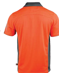
BAC K VIEW