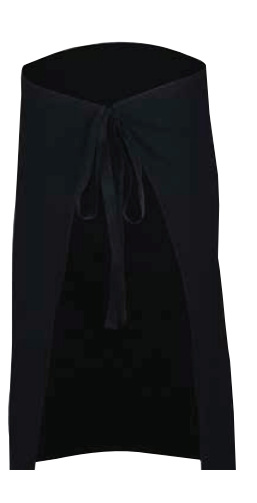
G TOUCH WEADING